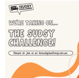
Social Media Tile