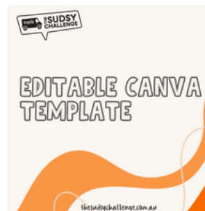
Editable Canva Templates