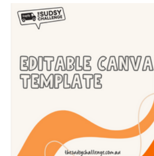
Editable Canva Templates